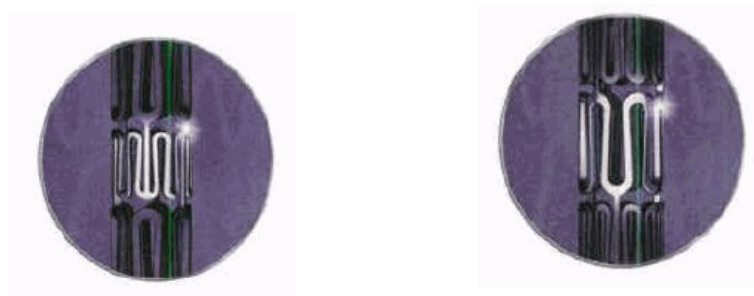
Figure 2 - Micro-Element Exemplar Close-Up (Left), Macro-Element Exemplar Close-Up (Right) - Martinez Decl. Ex. 3