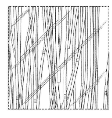
D'068 patent, Figure 3

3form challenges the district court's summary judgment of invalidity of the D'068 patent as obvious. The primary reference on which the district court relied in invalidating the D'068 patent was one of Lumicor's own panels, known as "Exhibit 5":